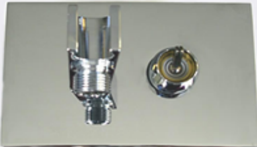
KIT7300 / KIT7500-Assembly-Step 3

Lubricate the shower dock o rings with plumbers silicone grease then slide the shower dock over the stem and tighten securely in position with the allen screw located on underside of the dock