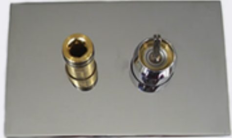
KIT7300 / KIT7500-Assembly-Step 2

Lubricate rubber seal on largest aperture in eschuchen plate with liquid soap. Slide eschuchen over the 2 valve block stems pushing down evenly and gently in to position, ensuring not to snag and damage the o rings on the shower dock stem