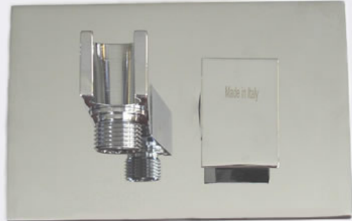
KIT7300 / KIT7500-Assembly-Step 4

Fit the valve handle over the valve toggle and secure in position by tightening the screw through the access hole in the top of the handle, complete by pushing the chromefinishing cap in to the aperture.