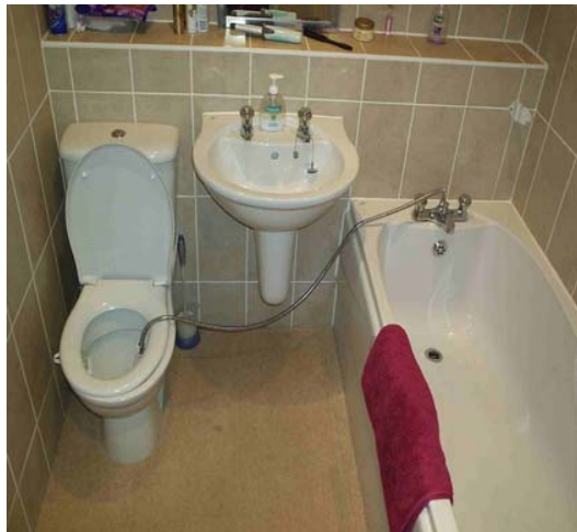
Figure 1a: Bath shower hose which is long enough to reach the WC

The same risk arises from flexible shower hoses installed adjacent to WCs for personal cleansing in place of toilet paper.