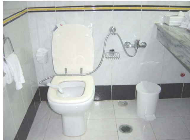
Figure 1b: Shower hose provided for personal cleansing